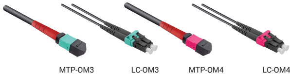
MTP-OM3 LC-OM3 MTP-OM4 LC-OM4