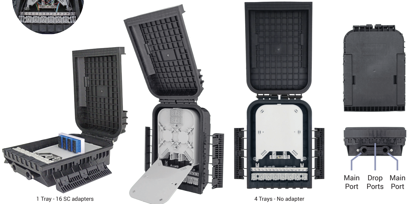
1 Tray - 16 SC adapters